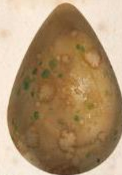
COMMON WELSH GREEN