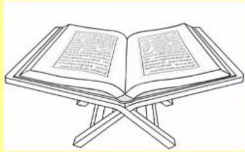
Qur'an and stand

Draw and label objects that are important to muslims.