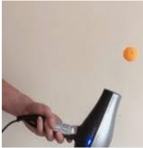
Make a Ping Pong Ball Float