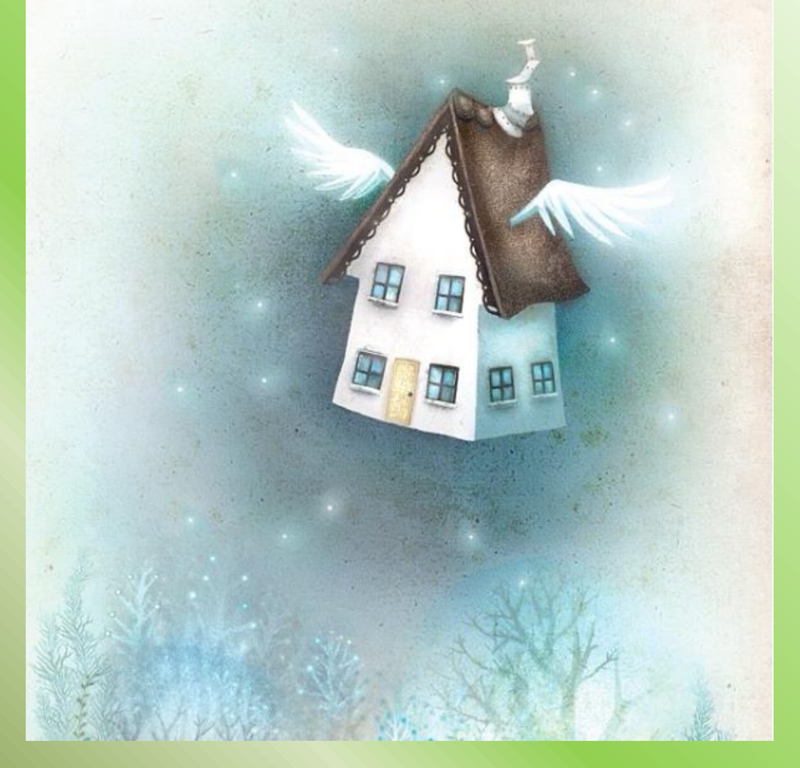
If this was the front cover of a book what would the story be about?