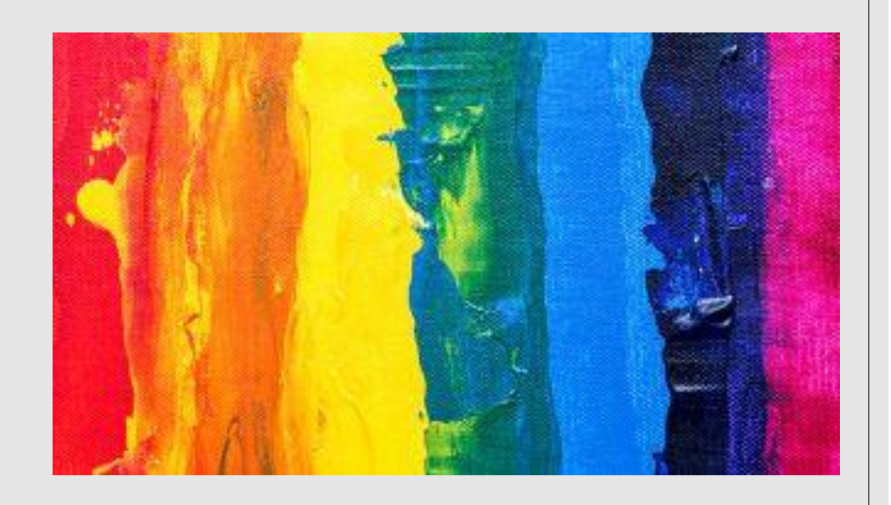
Can you create a picture like this?